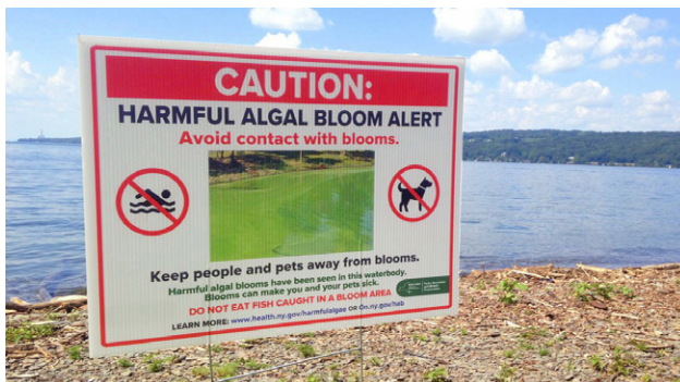
Taughannock Falls State Park in New York closed swimming area closure due to toxic algae outbreak.

OCX observations will support ecological forecasters, marine resource managers, fisheries, health departments, water treatment managers, and the commerce, recreation, and tourism industries.