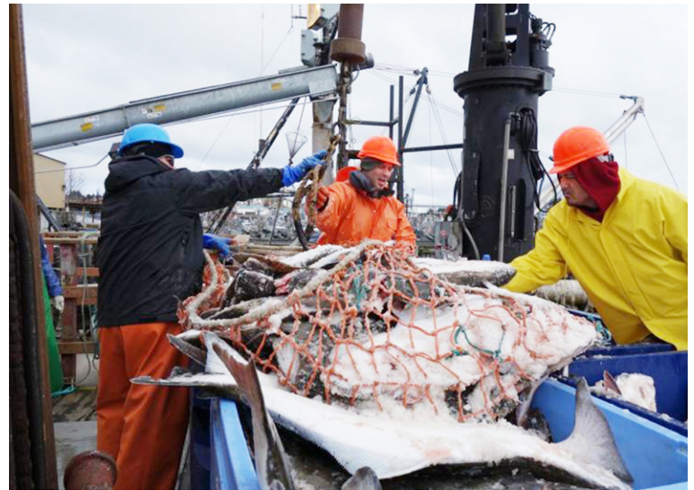
Fishermen unload halibut catch.

Acute health effects associated with marine pathogens and HAB toxins are estimated to cost almost $1 billion per year. Improved ecological forecasts will provide more time for decision-making and mitigation efforts, reducing both the costs and effects of HAB events. OCX data will also aid better predictions of when conditions will return to normal, allowing decision-makers to lift beach and fisheries closures as quickly and safely as possible.