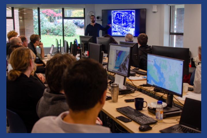
NESDIS-run workshops on digital elevation models give local scientists and emergency managers the knowledge required to develop and update DEMs used in modeling and planning for a resilient community.

Capacity-building fosters collaboration and coordination, as well as capability to use NESDIS information and products.